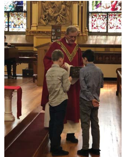
Picking the parish council on Palm Sunday