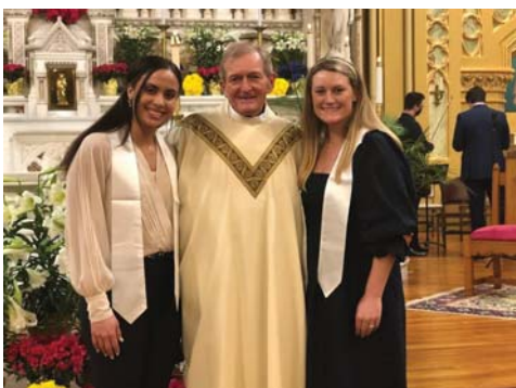
Welcomed fully into the Church