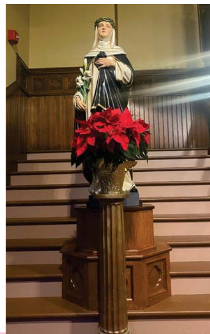
St. Catherine of Siena Feast Day 4/29

I am God's Child. Lavished in LOVE. Gifted with GRACE. Showered with MERCY. Overflowing with HOPE.