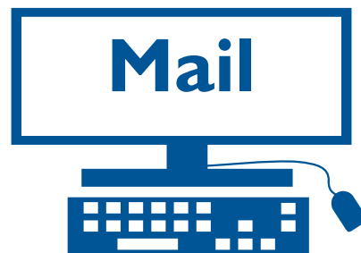
To your inbox

Sign Up at www.pilotbulletins.net/sign-up