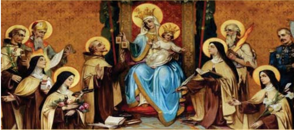
Boston Carmel Chapel mural